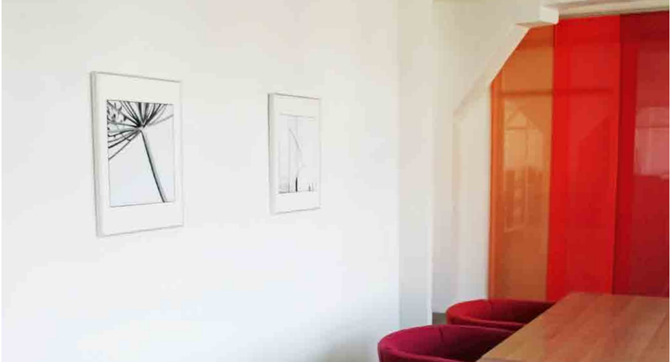
Black-and-white photography displayed with minimal reflections and UV protected by MIROGARD® Anti-Reflective Glass in a living room.